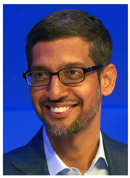
Alphabet CEO Sundar Pichai

Alphabet was also one of the biggest winners from another Trump-law loophole: "bonus depreciation". This special break allows companies to write off the full cost of big-ticket items like buildings, machinery and vehicles instead of over time, which better reflects their slow loss of value. Over the first five years of the Trump tax law, Alphabet saved $6 billion in taxes thanks to this one loophole, about 9% of the savings enjoyed by the 25 big firms that gained the most.