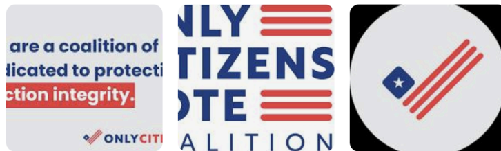
Only Citizens Vote Coalition www.onlycitizensvotecoalit... Only Citizens Vote Coalition www.onlycitizensvotecoalit... Only Citizens Vote Coalition www.onlycitizensvotecoalit...