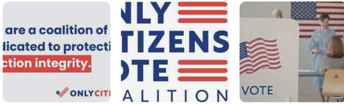
Only Citizens Vote Coalition www.onlycitizensvotecoalit... Only Citizens Vote Coalition www.onlycitizensvotecoalit... Only Citizens Vote Coalition www.onlycitizensvotecoalit...