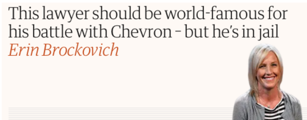
[The Guardian, 02/08/22 ]