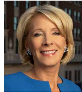
The Honorable Betsy DeVos 11th United States Secretary of Education