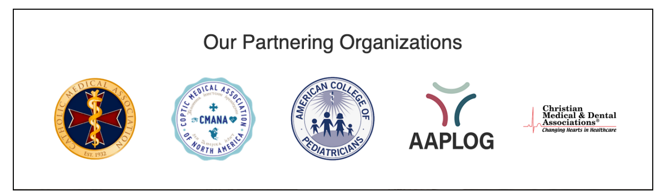
[Alliance for Hippocratic Medicine, accessed 9/29/23]

November 2022: The Alliance For Hippocratic Medicine And Several Physicians Filed A Lawsuit In Texas Challenging The FDA's Approval Of Mifepristone. "Briefly for procedural context, the Alliance for Hippocratic Medicine ('AHM') and several physicians (collectively, 'Plaintiffs') filed a lawsuit last November in the Northern District of Texas challenging the FDA's approval decisions of mifepristone. AHM also requested that the District Court issue a preliminary order requiring the FDA to withdraw or suspend the use of mifepristone and remove it from the list of approved drugs nationwide." [Reuters, <u>9/8/23</u>]