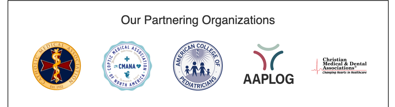
[Alliance for Hippocratic Medicine, accessed <u>9/29/23</u>]

The Alliance For Hippocratic Medicine Is An Alliance Of Anti-Abortion And Anti-LGBTQ Physicians Groups, Including The American Association Of Pro-Life Obstetricians And Gynecologists, The American College Of Pediatricians, Christian Medical & Dental Associations, And Catholic Medical Association.