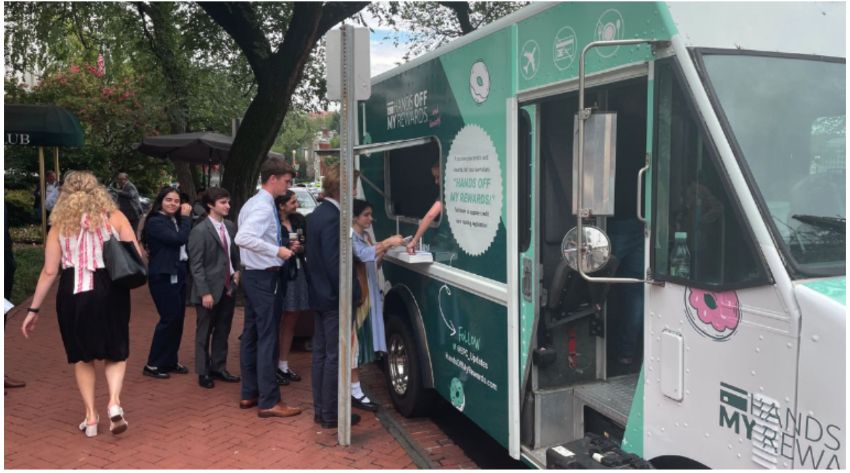
[Payments Dive, 09/15/23]

The Slogan Read "Donut Touch My Rewards," Accompanied By Claims The Bill Would "Lead To The Elimination Of Credit Card Benefits" For Items Such As Dining, Gas, And Groceries. "Donut Touch My Rewards,' the EPC's slogan reads. The law would 'lead to the elimination of credit card benefits that consumers and small businesses rely on – such as credit card rewards for travel, dining, gas points, groceries, and more,' according to information provided by the coalition." [Payments Dive, <u>09/15/23</u>]