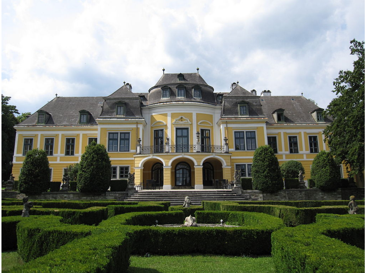
[Wikipedia, Accessed 4/25/23 ]