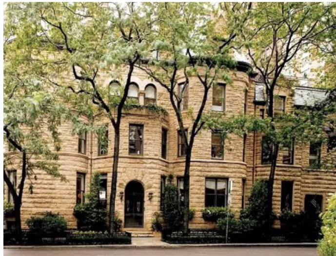
25 East Banks St., Chicago, IL 60610

In 2010, Jamie Dimon Sold His Chicago Mansion For $6.5 Million, As JPMorgan Spent Over $421,000 Covering His Real Estate Commissions. "Jamie Dimon sold his Gold Coast home in Chicago for $6.5 million last year, only slightly more than the ~$4.7 million he reportedly bought it for in 2000. Perhaps the tremendous markdown Dimon took on the house (he originally listed it for $13.5 million in 2007) explains why, even though Dimon earned $21 million in cash and stock awards in 2010, JPMorgan covered his $421,458 tab in real estate commissions. [...] JPMorgan's proxy says that the payment was 'in accordance with the firm's general policy on relocation expenses, applicable to all eligible employees who relocate at the request of the firm.'" [Business Insider, 04/08/11 ]