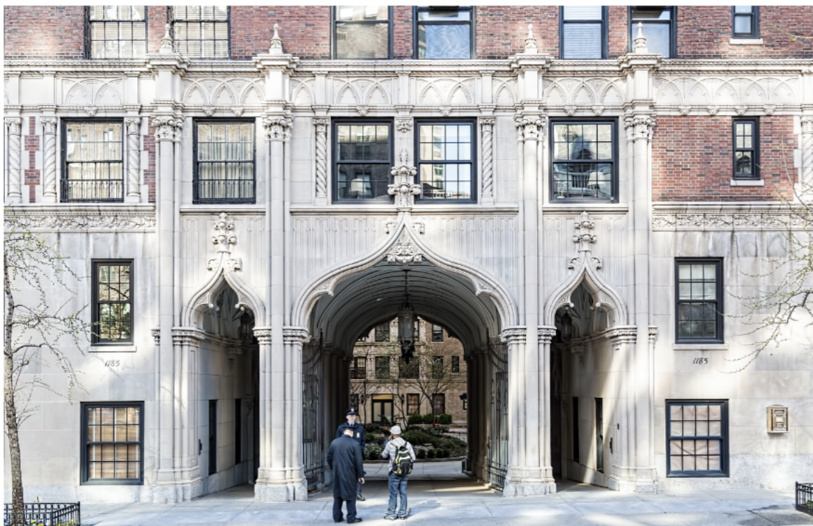
[New Yorkitecture, accessed 05/02/22 ]