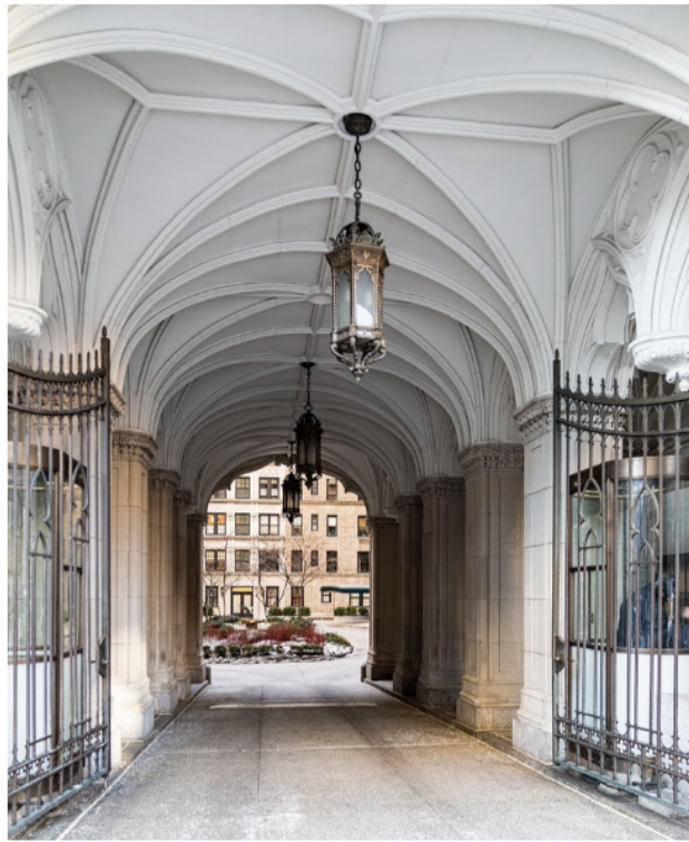
[New Yorkitecture, accessed 05/02/22 ]