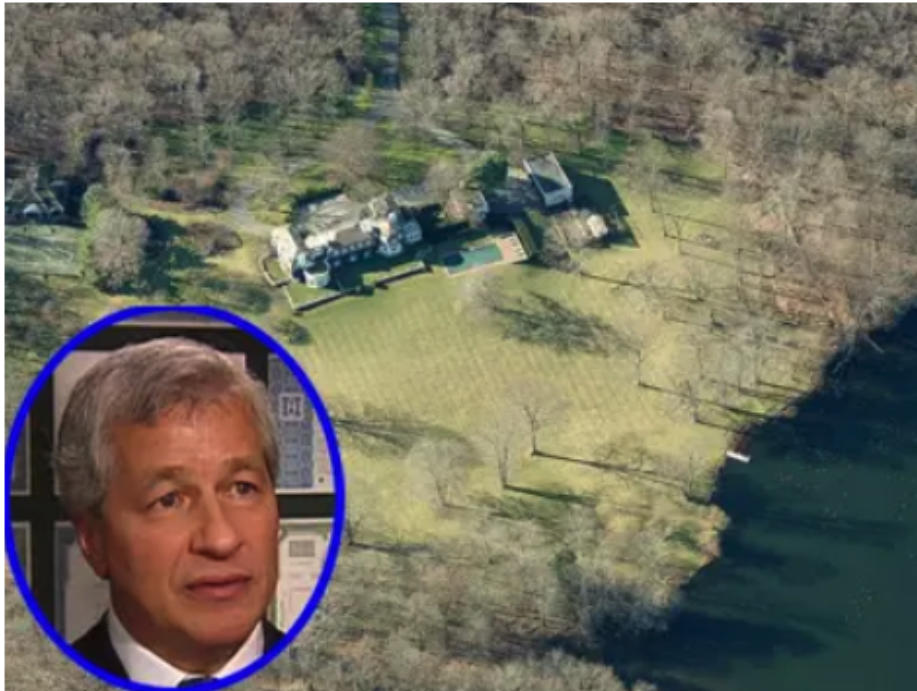
Screenshot via Bing Maps