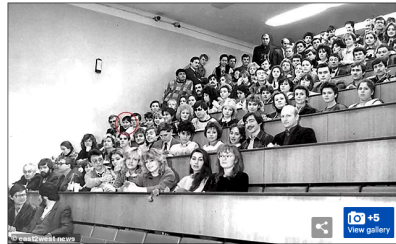
Saule Omarova (circled) is photographed during her studies at Moscow State University, in Russia in 1988 when Mikhail Gorbachev was president of the Soviet Union. She studied under a scholarship named after Vladimir Lenin and wrote a thesis on Karl Marx.