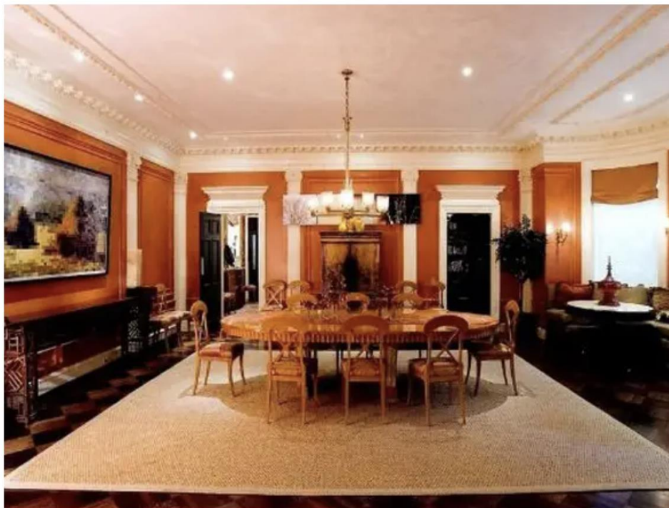
[Business Insider, 04/08/11 ]

As Bank Of America Agreed To Over $130 Million In Settlements For Misconduct From 2020 Through 2021—Including A $75 Million Overdraft Case In 2021, Settled Just Months Before CEO Brian Moynihan Said Overdraft "Pays For The Shareholder"—Moynihan Saw His Total Compensation Increase By More Than 30% To $32 Million In 2021, Continued Taking Hundreds Of Thousands Of Dollars A Year In Private Jet Compensation Despite Controversy, And Appears To Live In A Near-$4.3 Million House In "One Of The Richest Towns In The US." All While His Bank Made Over $1.1 Billion In Overdraft Or Non-Sufficient Fund Revenue In 2021.