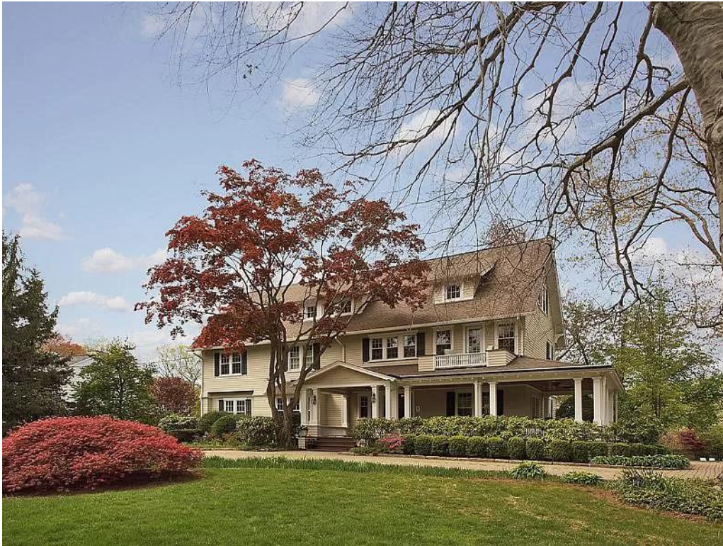
[Zillow, accessed 05/06/22]

tranquility surrounds you. 6,839 square foot on 3 levels and quality renovations throughout. A separate guest/pool house features a 2-story great room with stone fireplace and doors that lead to patio with pergola, a Shoreline pool and hot tub. This exceptional property in a country setting is convenient to all." [Zillow, accessed 05/06/22]