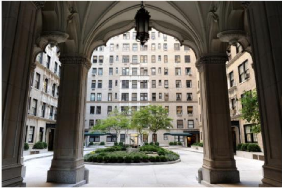
[Forbes, 10/22/15 ]