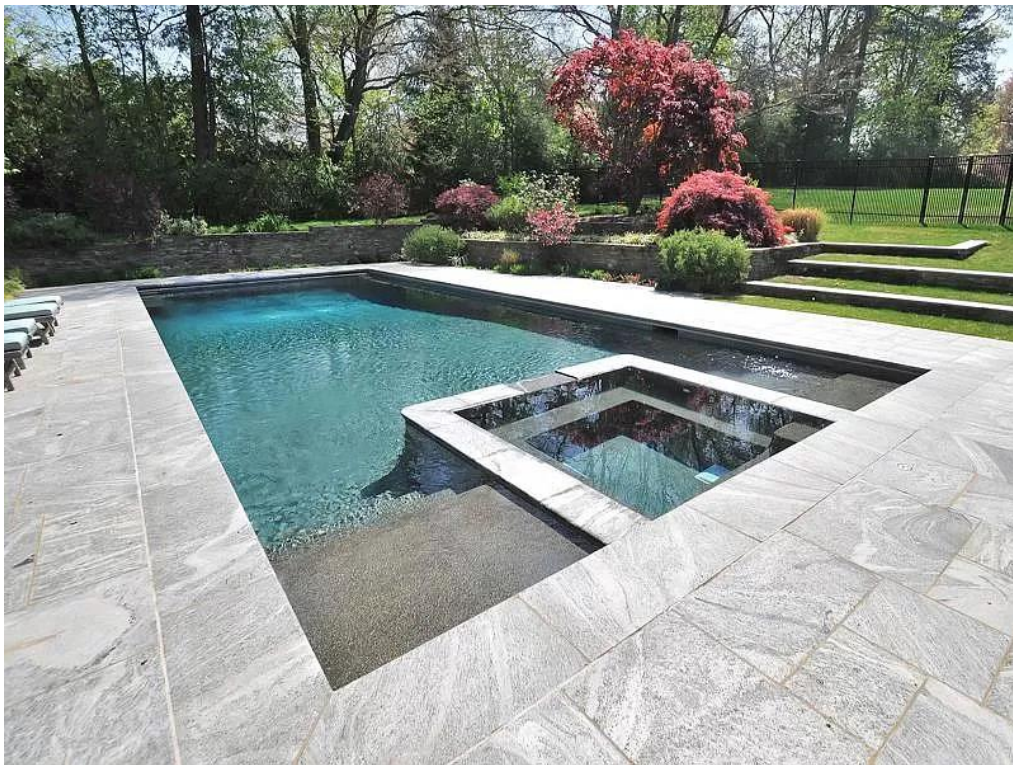
[Zillow, accessed 05/06/22]