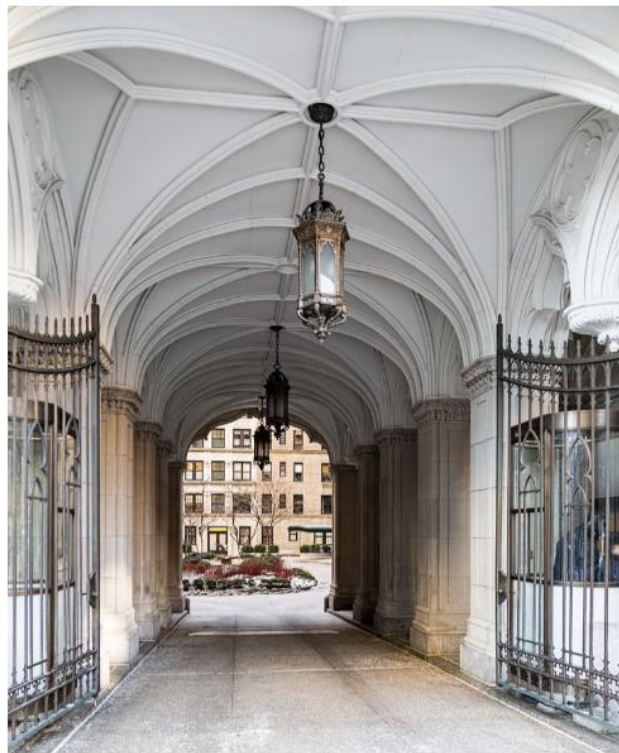
[New Yorkitecture, accessed 05/02/22 ]