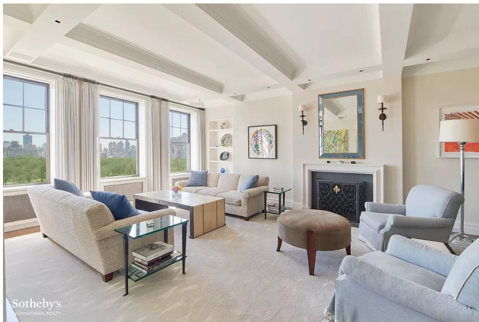
[StreetEasy, accessed 04/29/22]

The Building Is "One Of Manhattan's Finest Pre-War Cooperatives" And Features "24/7 Doormen, Front Hall Men, Porters, And Resident Manager" And A "State-Of-The-Art Fitness Center." "101 Central Park West is one of Manhattans [sic] finest pre-war cooperatives. Designed in 1928 by the acclaimed architectural firm Schwartz & Gross, it is superbly located on CPW between 70th & 71 st Streets, near scores of great restaurants, schools, clothing boutiques and food shopping, with ready access to the West Side subway and bus lines. Staff includes 24/7 doormen, front hall men, porters and resident manager. There is a state-of-the-art fitness center, a bike room and private storage conveyed with the sale." [StreetEasy, accessed 04/29/22]