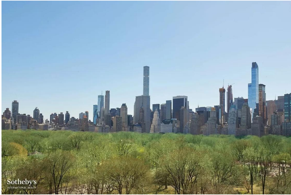
[StreetEasy, accessed 04/29/22]