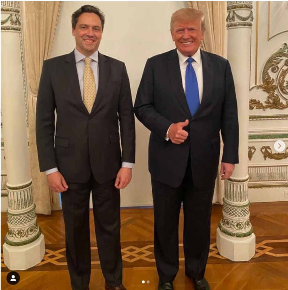
[Instagram - @lbragancabr, 10/21/21 ]