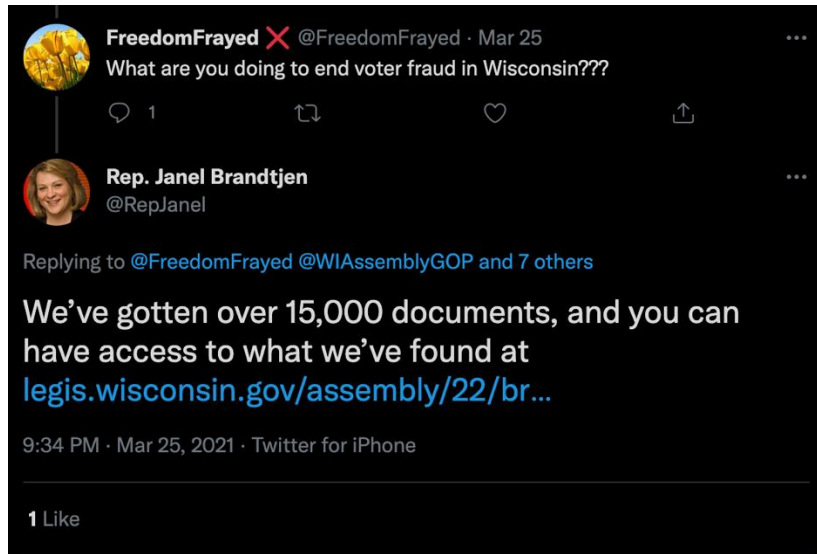
[Twitter - @RepJanel, 3/25/21 ]