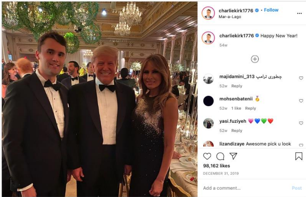
[ Instagram Post by Charlie Kirk , 12/31/19, accessed 01/15/21]