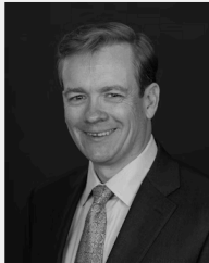
Executive Vice President and Chief Counsel, U.S. Chamber Litigation Center, U.S. Chamber of Commerce