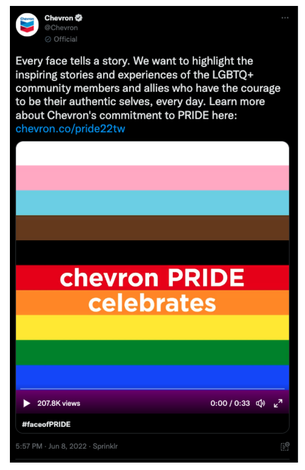
[Twitter, @Chevron, 6/8/22]

Chevron Tweeted About Their "Commitment To PRIDE." "Every face tells a story. We want to highlight the inspiring stories and experiences of the LGBTQ+ community members and allies who have the courage to be their authentic selves, every day. Learn more about Chevron's commitment to PRIDE here: https://chevron.co/pride22tw"