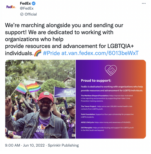
[Twitter, @FedEx, 6/10/22]

FedEx's PAC And Key Company Staff Have Contributed $86,700 During The 2022 Election Cycle To Senate Opponents Of The Respect Of Marriage Act. [Accountable.US, American Democracy Scorecard, accessed 11/29/22]