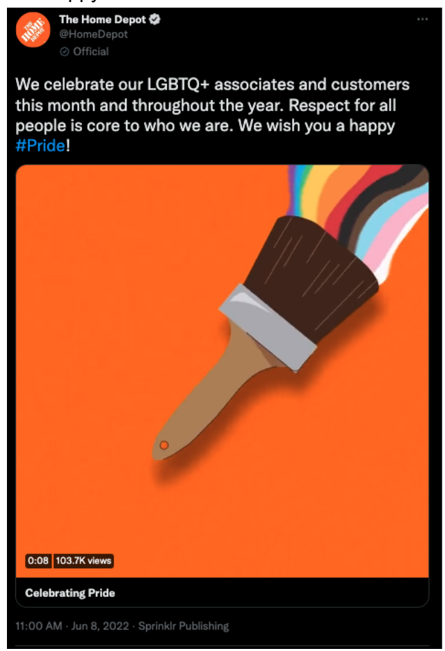
[Twitter, @HomeDepot, 6/8/22]

During Pride Month, Home Depot Tweeted That "Respect For All People Is Core To Who We Are." "We celebrate our LGBTQ+ associates and customers this month and throughout the year. Respect for all people is core to who we are. We wish you a happy #Pride!"