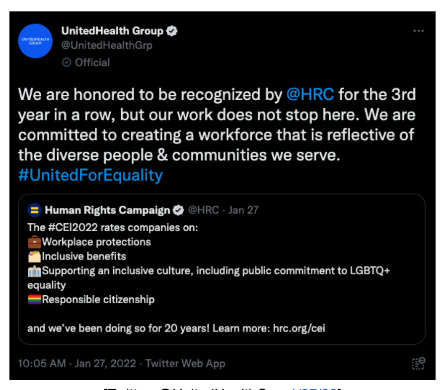
[Twitter, @UnitedHealthGrp, <u>1/27/22</u>]

On Twitter, Unitedhealth Declared Their Commitment To "Diverse People & Communities," Saying It Was Honored To Be Recognized By The Human Rights Campaign. "We are honored to be recognized by @HRC for the 3rd year in a row, but our work does not stop here. We are committed to creating a workforce that is reflective of the diverse people & communities we serve. #UnitedForEquality"